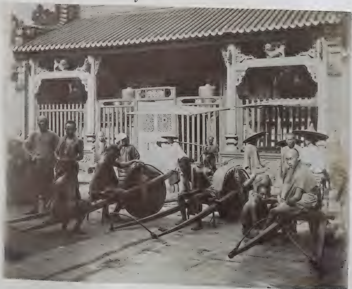
Wheelbarrow men before Temple in Harbin, May 21, 1897